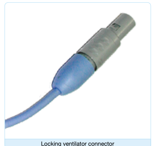
Locking ventilator connector