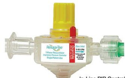
In-Line PIP Controller with Override Button

New Resusa-Tee T-Piece Resuscitator with Built-In, Color-Coded Manometer 0 - 60 cm H 2 O and Adjustable PIP Controller with Override Button