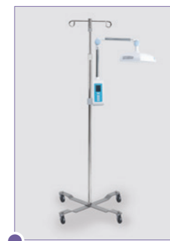
with IV pole