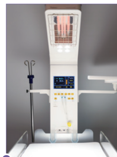
LED examination light