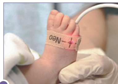
Masimo Pulse oximeter*