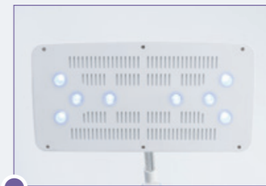
8 Power LED